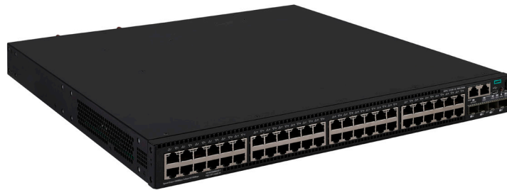
HPE FlexNetwork 5140 48G PoE+ 4SFP+ HI Switch (R9L64A)