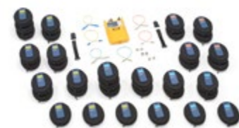
OptiFiber Pro Quad OTDR