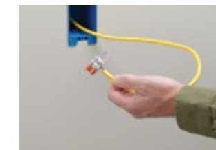
2. Determine wiring scheme. Dress all four pairs (eight wires).