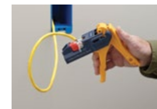
4. Ensure jack is completely and securely inserted in jack holder bed with IDC slots facing the blades.