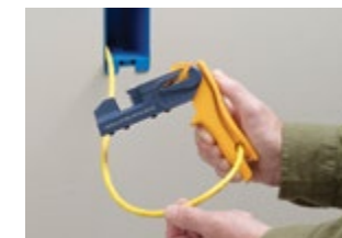
1. Strip cable jacket with a standard cable stripper or the built-in cable stripper.