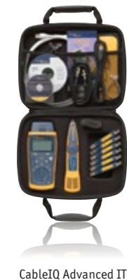
CableIQ Advanced IT Kit