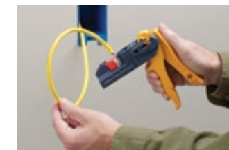
3. Insert jack in JackRapid front first with IDC slots facing blades of JackRapid.