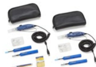
Fiber inspection and cleaning

Fiber inspection and cleaning: (2) Versiv USB inspection cameras and tips sets, (2) OneClick Cleaners (1.25 mm), (2) OneClick Cleaners (2.50 mm), Enhanced Fiber Optic Cleaning Kit with OneClick cleaners