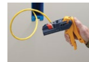
5. Pull trigger completely and remove excess wire prior to releasing trigger.