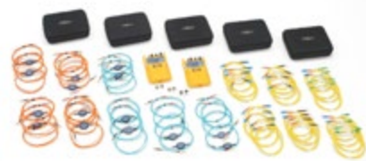
CertiFiber Pro Quad OLTS