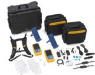
Versiv mainframe and accessories

To learn more visit: www.flukenetworks.com/dsx