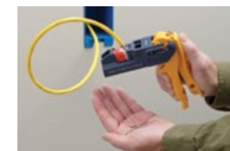
6. Wires will be seated and cut for a solid termination.