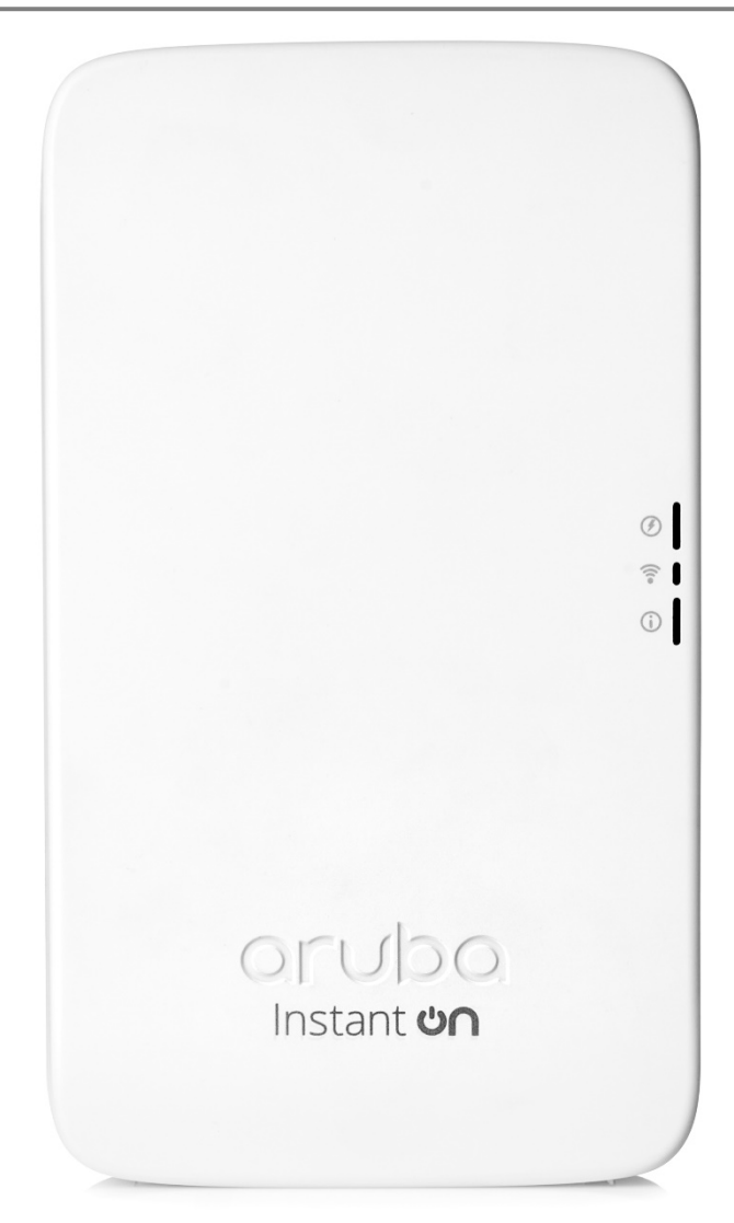
Aruba Instant On AP11D Desk/Wall Access Points

Whether you own a small law office or a trendy boutique hotel, your employees and customers are relying on the network for almost everything they do. And because Wi-Fi plays such a crucial role today, you need a purpose-built solution that keeps your business on the go. Aruba Instant On Access Points (APs) are easy to deploy and manage—with a quality look and feel at an attractive price point.