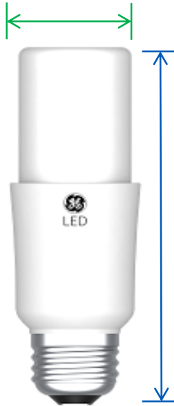
LED Bright Stik