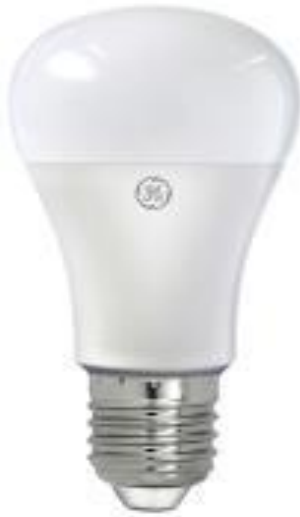
LED A line