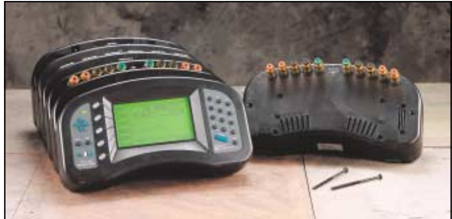
Each module connects and disconnects easily from the Black Stack with just two screws.

The SPRT module reads 25-ohm and 100-ohm four-wire RTDs, PRTs, and SPRTs with very high accuracy. It turns the Stack into a first-rate reference thermometer with an accuracy to \pm 0.005^\circ\text{C} .