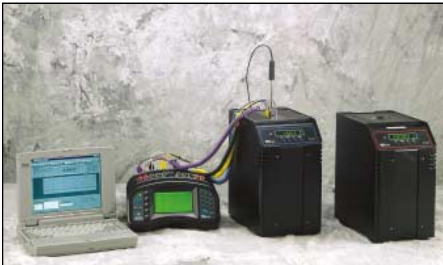
The Black Stack is the perfect foundation to build a totally automated calibration system with Hart heat sources and 9932 Calibrate-it software (see page 80). No programming or system design nightmares.