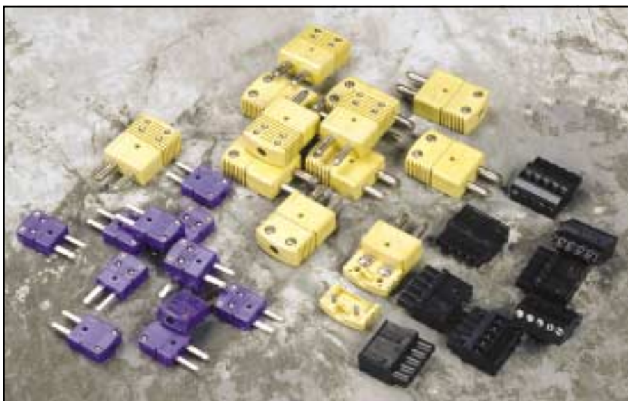
Convenient connector kits are available so you're ready to connect your sensors to Hart's scanner modules. The PRT and thermistor scanners include one set of eight probe connectors, but you may want spares. The thermocouple scanner does not include probe connectors due to the variety of thermocouple types and the mini versus standard sizes. You can choose just what you want from our list in the ordering information.

The 2563 Thermistor Module has two input channels. It displays direct resistance in ohms or converts directly to a temperature readout using either the Steinhart-Hart equation or a higher-order polynomial.