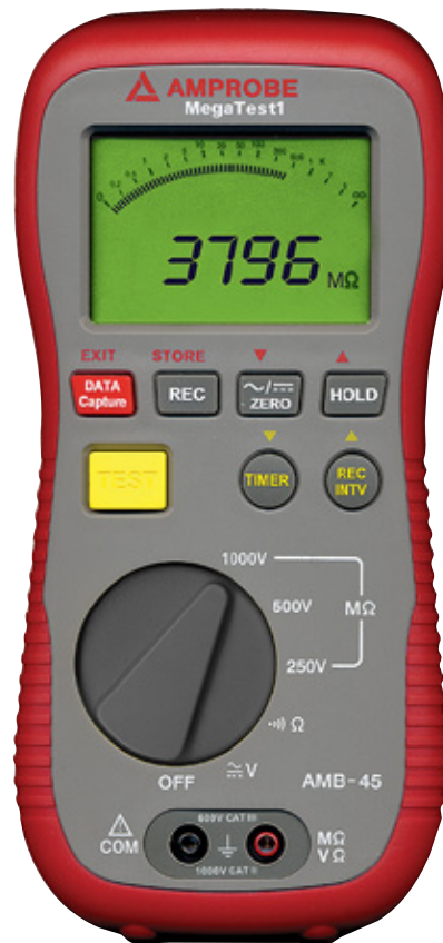
AMB-45 Insulation Resistance Tester