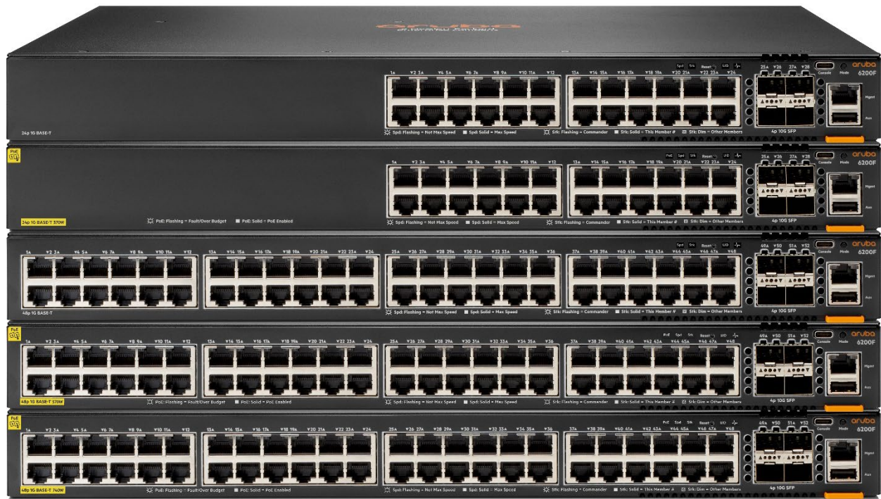
Aruba CX 6200 Switch Series

Aruba Dynamic Segmentation extends Aruba's foundational wireless role-based policy capability to Aruba wired switches. What this means is that the same security, user experience and simplified IT management can be enjoyed throughout the network. Regardless of how users and IoT devices connect, consistent policies are enforced across wired and wireless networks, keeping traffic secure and separate.