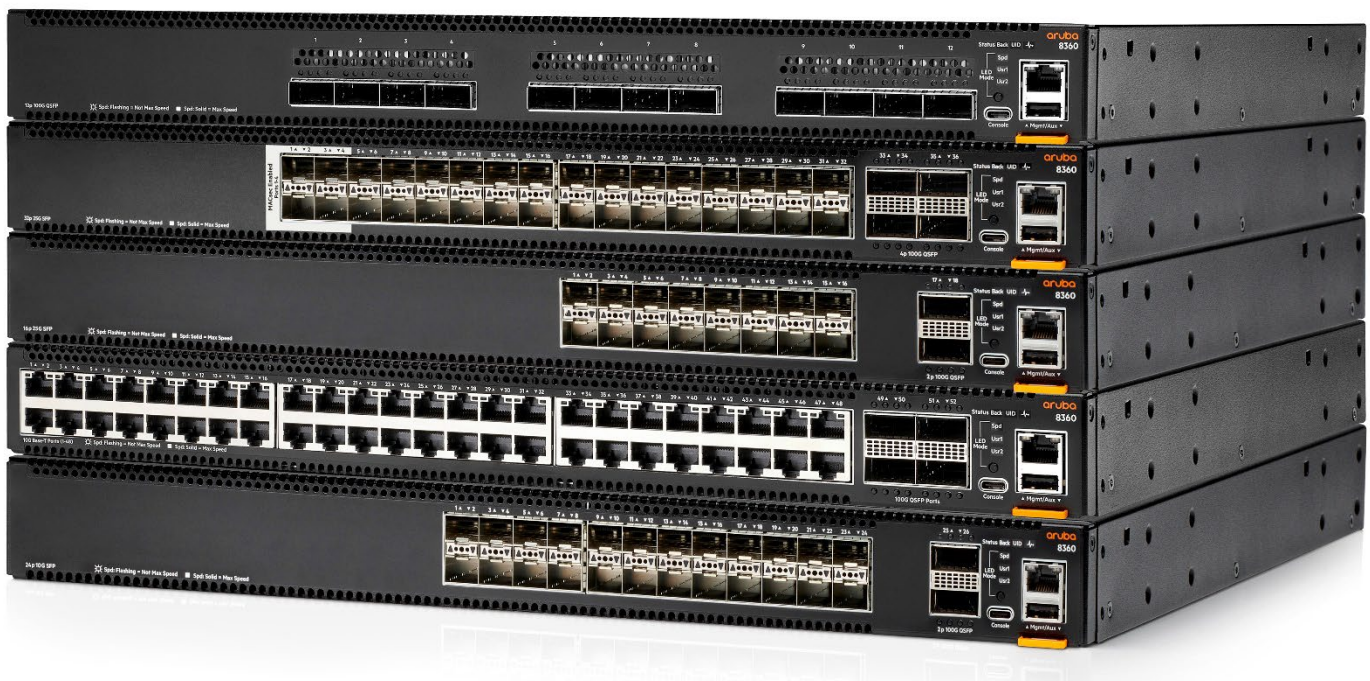
Aruba CX 8360 Switch Series

In addition, the 32 x 25G port 8360 models support low density MACsec ports and enable secured connectivity at 10GbE and 25GbE over unsecured domains.