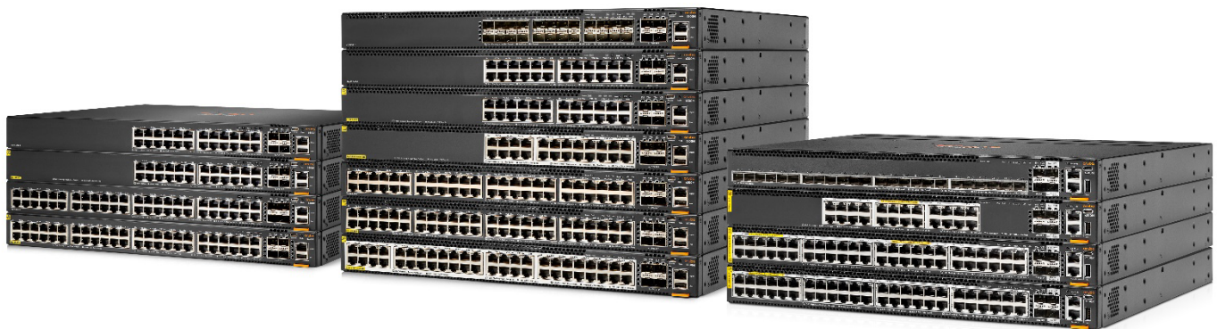
Aruba CX 6300 Switch Series

Aruba Dynamic Segmentation extends Aruba's foundational wireless role-based policy capability to Aruba wired switches. What this means is that the same security, user experience and simplified IT management can be enjoyed throughout the network. Regardless of how users and IoT devices connect, consistent policies are enforced across wired and wireless networks, keeping traffic secure and separate.