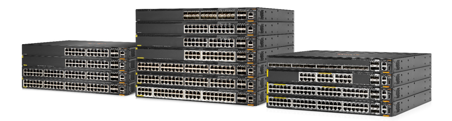
Aruba CX 6300 Switch Series

Aruba Dynamic Segmentation extends Aruba's foundational wireless role-based policy capability to Aruba wired switches. What this means is that the same security, user experience and simplified IT management can be enjoyed throughout the network. Regardless of how users and IoT devices connect, consistent policies are enforced across wired and wireless networks, keeping traffic secure and separate.