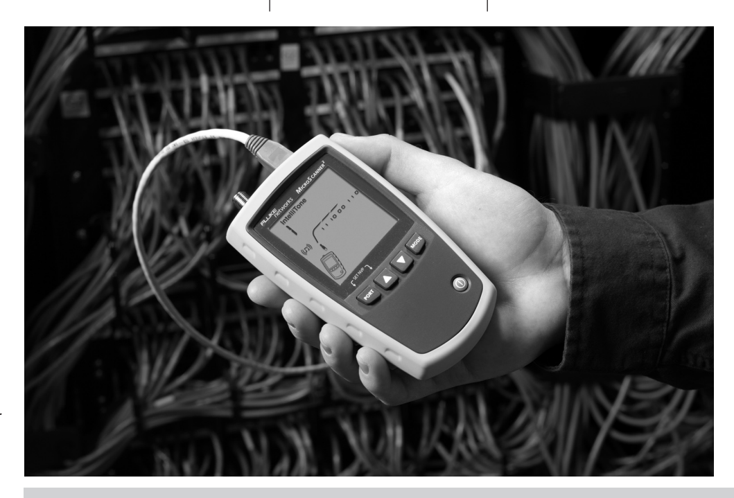
MicroScanner<sup>2</sup> Cable Verifier High power vision into voice/data/video cabling