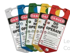
Legend 1 and 2 Color Options

*Combo includes 1 each of the five colors listed above.